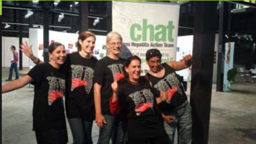
CHAT Art and Story Telling Resilience Exhibition