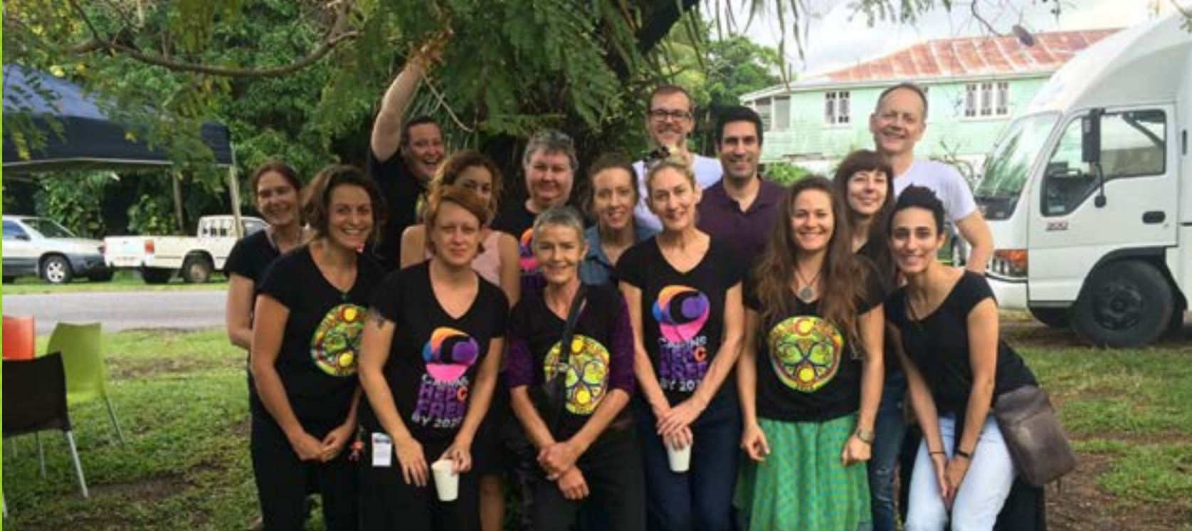
Youthlink outreach with paid peers 2017