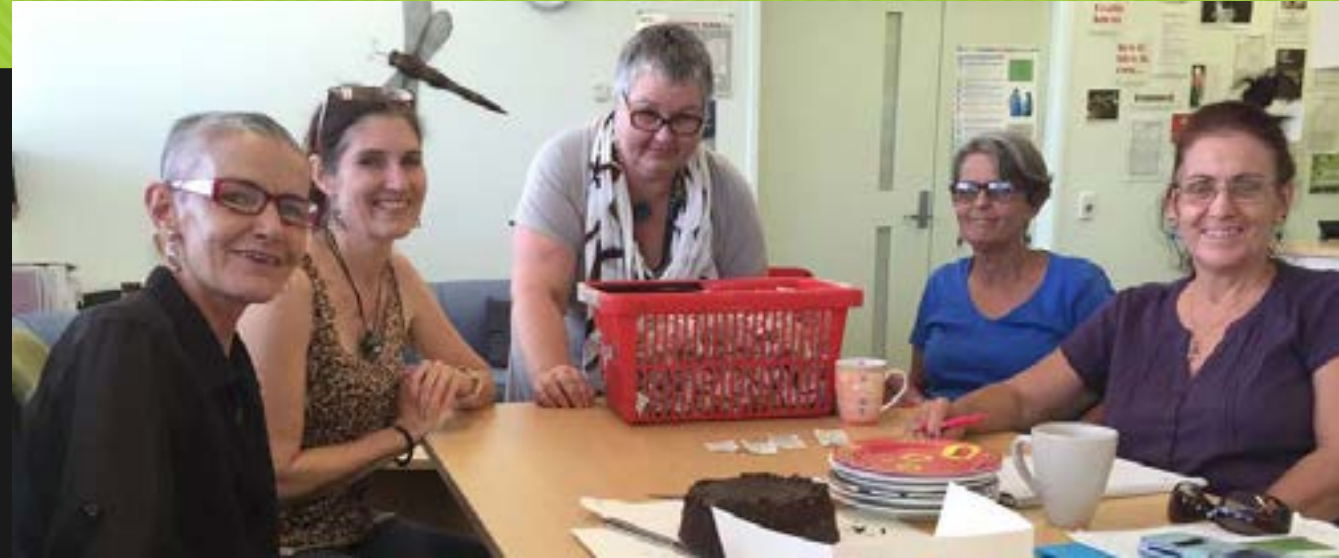
CHAT meeting, friendship and support