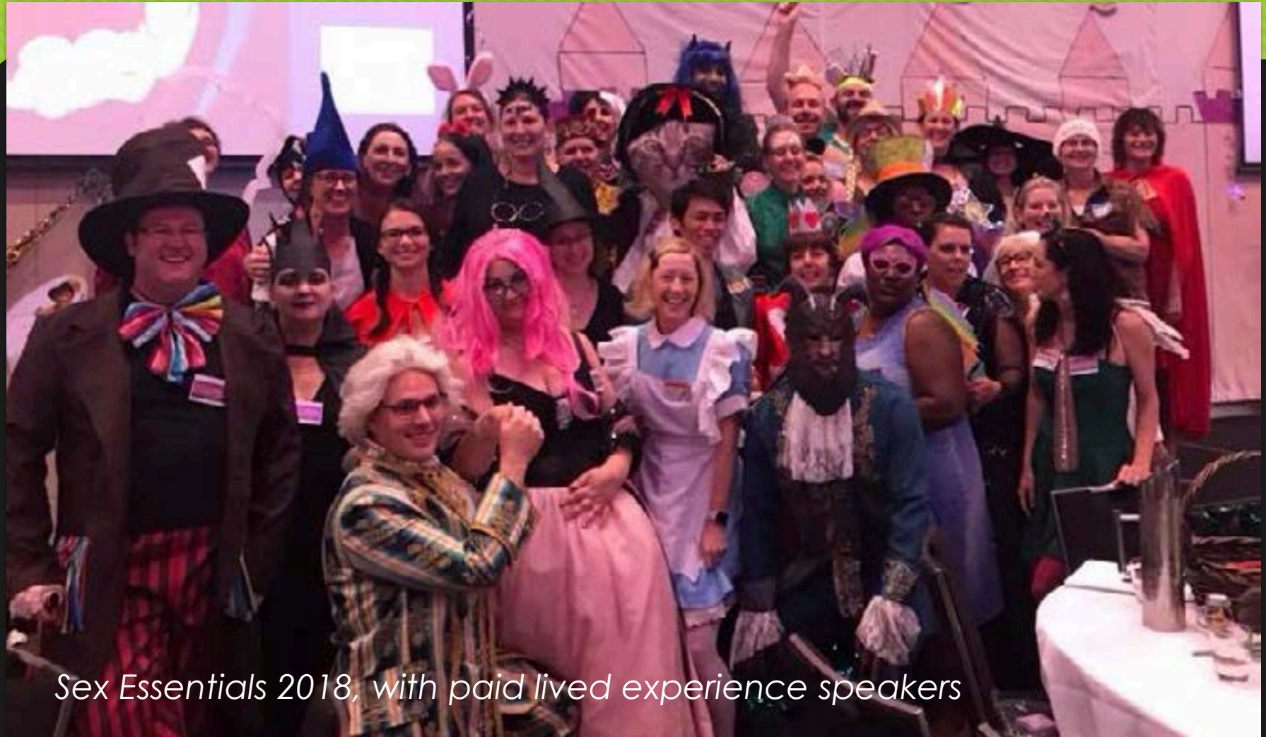
Sex Essentials 2018, with paid lived experience speakers