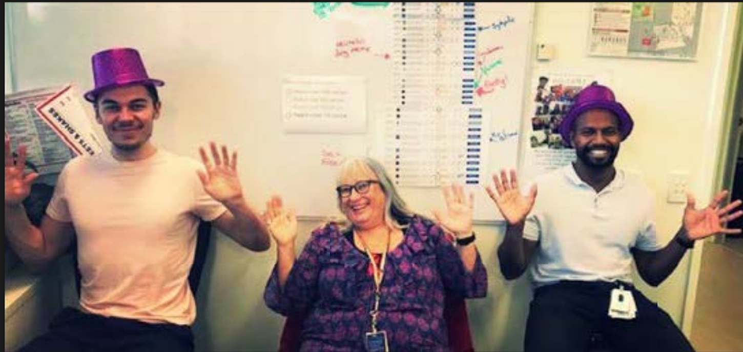
Wear it Purple Day 2018